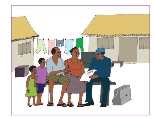
Before signing an insurance policy, make sure you understand everything about the policy.

Give truthful information. Make sure you understand what you buy and which loss or damage is covered by your insurance