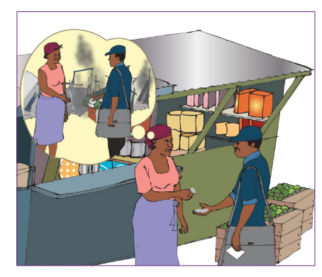
Pay your small premiums regularly to be protected against future uncertainties.

This is how microinsurance works: your small payment is put into a pot and will be used together with everyone else's contributions to pay for the loss suffered by you or any insured member. However, it is important to understand that only those people who have contributed according to the prior agreement to the pot will receive the compensation from the company. There are different pots for specific purposes, e.g. one pot covers the expenses of a funeral and another pot covers the expenses of market stores which have been burnt down by a fire. You need to assess to which pot you would prefer to contribute your money, so you need to ask yourself which insurance you really need.